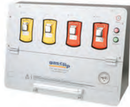
SGC Wall Mount Dock

Also available in High Pressure Part# SGC-DOCK-HP