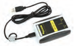
GCT IR Link

Also available in High Pressure Part# SGC-WMDOCK-HP